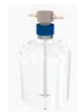
DI-111-A, Water Trap for Liquid Digestion