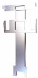
DI-050-A1, Cooling stand 10 DI-050-A2, Cooling stand 20 to mount on Digester Auto, for both Tube Rack and Exhaust

The KjelROC Digestion portfolio offers something for most labs