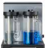
DI-110-A, KjelROC Scrubber

DI-211-A, KjelROC Digestor Auto 10 DI-220/221-A, KjelROC Digestor Auto 20 Our standard Digestion block with capacity for 10 or 20 tubes, one rack included and exhaust for DI-211/221-A