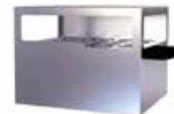
DI-010-A, Rack 10 DI-020-A, Rack 20