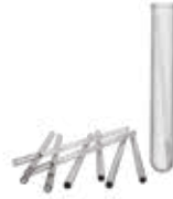
TU-222-A, Boiling Rods