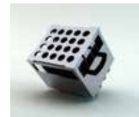
DI-052-A, Washing Lid 10 DI-053-A, Washing Lid 20

DI-211-A, KjelROC Digestor Auto 10 DI-220/221-A, KjelROC Digestor Auto 20 Our standard Digestion block with capacity for 10 or 20 tubes, one rack included and exhaust for DI-211/221-A